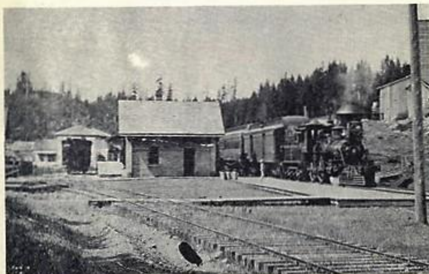
Oregon Pacific depot, Toledo.

The Oregon Pacific, soon after completion of its line between Corvallis and Yaquina, instituted freight and passenger connections with San Francisco. The first carload of wheat was shipped from Philomath to Corvallis Aug. 11, 1885. Steamship connections began Sept. 14, 1885. The fare between Corvallis and the California City was $14, the wheat rate $4.50