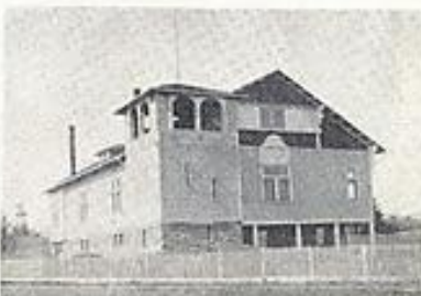
The Armory, OAC, 1910.

So-Second Street is coming to life again. I always said it was the best business street in town, and I've worked on it and run businesses on it since about 1920. You won't know it in ten years, I'll bet, even though it will probably be rid of me before then.