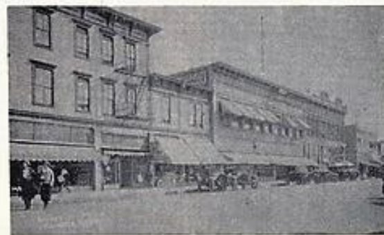
Second Street, about 1920