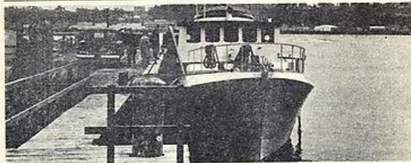
The Acona, OSU oceanography vessel, ties up at recently completed docking facilities designed by Cornell, Howland, Hayes and Merryfield, engineering-planning firm. The Acona will be replaced later this year by the Yaquina, which is five times larger. The Yaquina is now undergoing fittings to become a modern floating research laboratory under a $600,000 grant from the National Science Foundation to OSU.