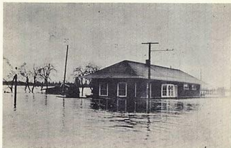
Oregon Electric depot in high water of 1920. This building was used many years by the OSU rowing club. It was razed to make way for the east approach of the new Harrison Street bridge.