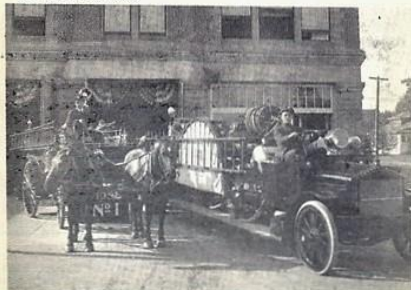
Fire wagons in front of old City Hall. Photo by courtesy of Cliff Francisco whose uncle Clifford was driving the horses.