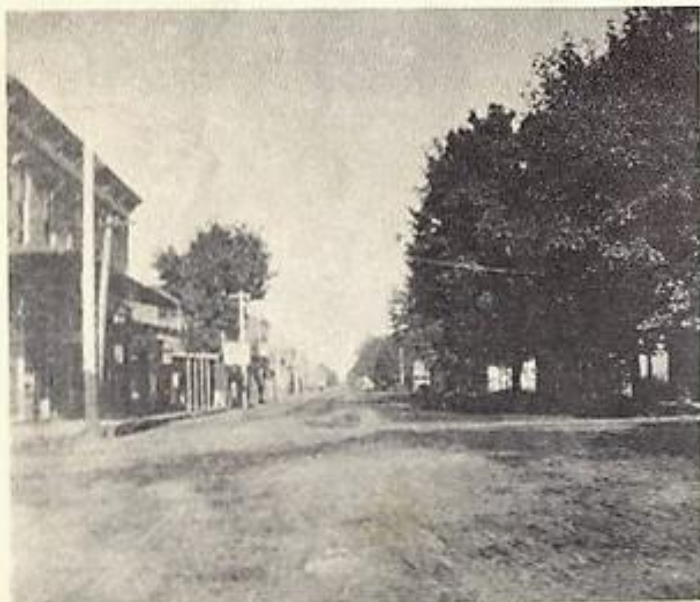
Second Street in late 1800's, looking north from Adams.