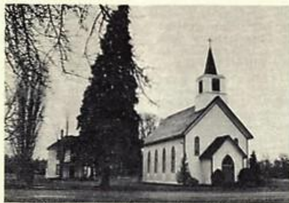
St. Louis Catholic Church and Rectory.

The town of St. Louis had its beginning in 1830 when several Frenchmen arrived as fur trappers. At that time the first Catholic Church, a log cabin, was built. In 1844 it was torn down and replaced by a second one, which was destroyed by fire about 1875. The third and present church was constructed in the 1880's and is now over seventy-five years old. The St. Louis church is one of the oldest west of the Rockies.