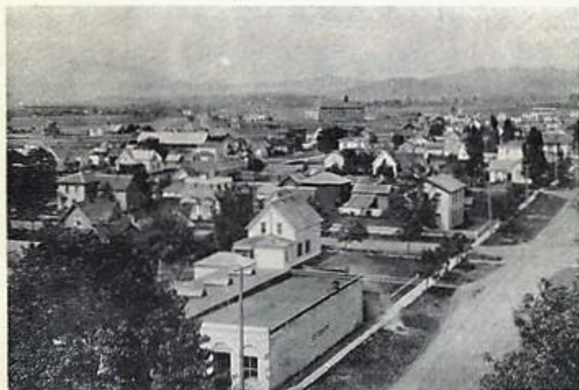
Adams Street at 2nd, looking west, about 1907. R. M. Wade & Company hardware store is in center foreground. The Spurlin and Robnett store is located here now. In the center background is the building of the carriage factory, at 13th and Washington Streets. Part of this building, with the upper stories removed, is now in use as a feed and seed warehouse.