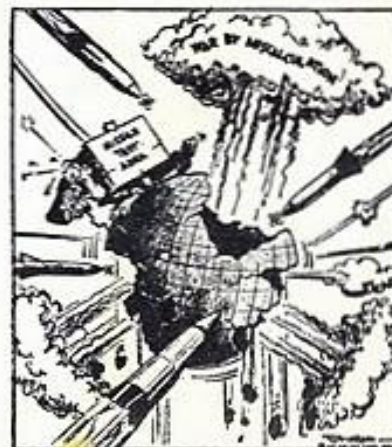
Conrad in the Denver Post "... I repeat—this is a test ... !!!"