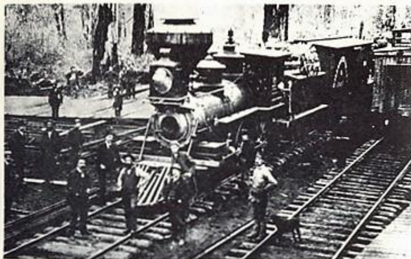
An Oregon Pacific construction crew at a rail loading dock.