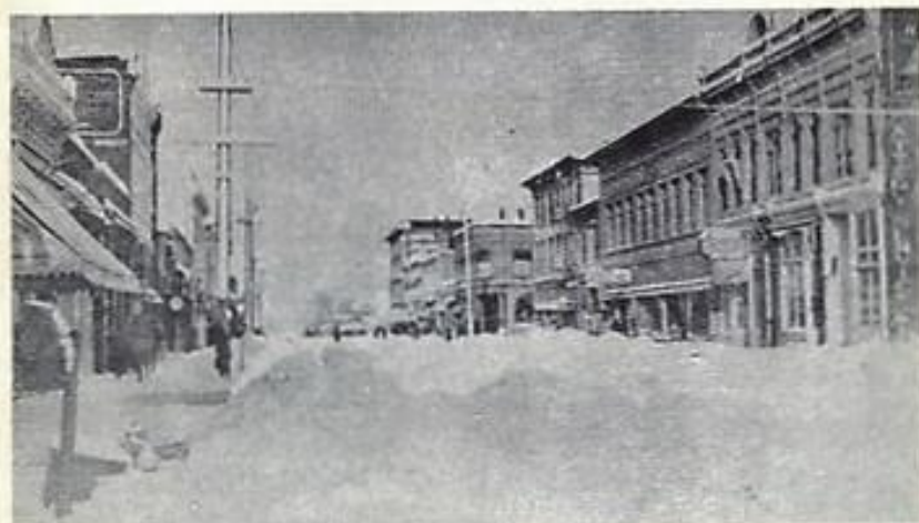
Oho! Spring came to 2nd Street this way in 1919. Snow and freezing weather hit hard in February and lasted well into March that year. This photograph is from Jefferson Street looking north. Oho! and Brrr!