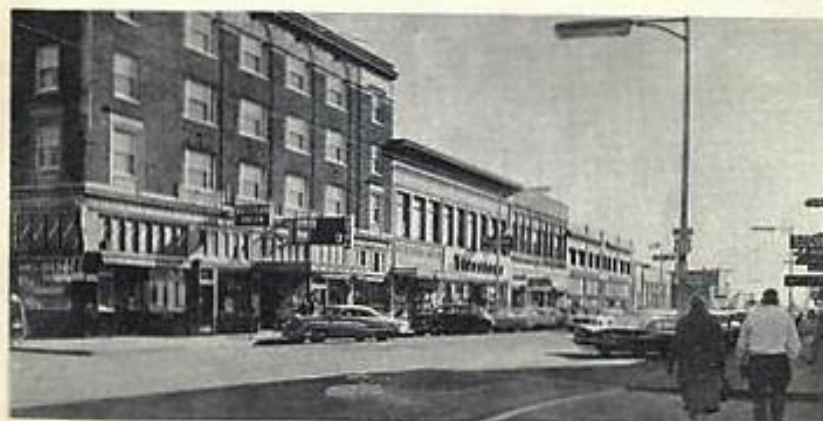
East side of Second street looking south from Madison, 1962