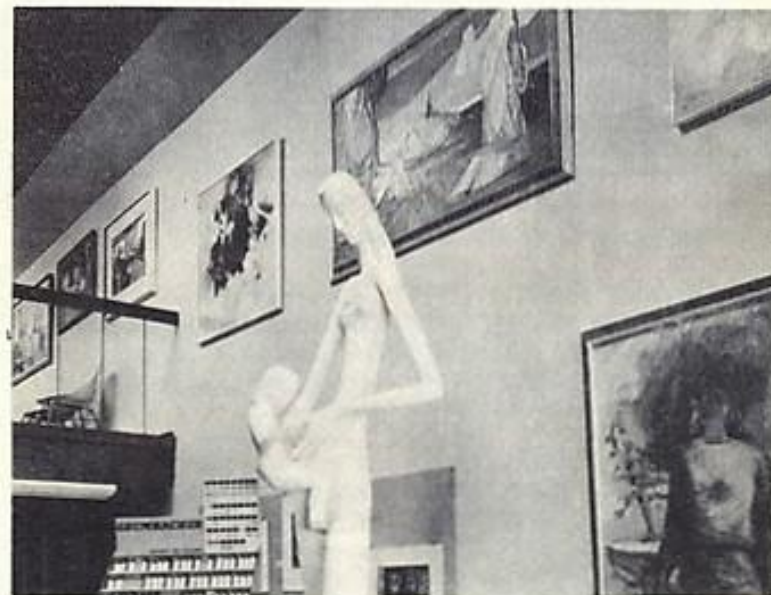
View of a section inside the Luehr Gallery.

People interested in fine art will be surprised to find such a big-city type of gallery in a town as small as Corvallis. All are cordially invited to drop in for a look-see. A buffet for refreshments is situated on the mezzanine.