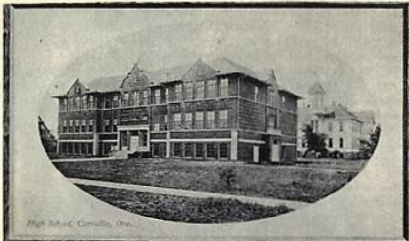
Corvallis High School about 1913. Later it was enlarged and faced with white brick veneer. It was destroyed by fire in the early 1940's. The Southern Pacific railroad station was directly across the street where the police station is now located. The old Central School is shown in the background.