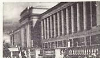
Memorial Union, OSU, before remodeling