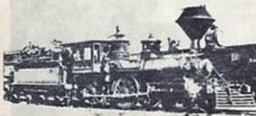
Corvallis & Eastern Number 4. The former Oregon Pacific 12 here wears a new number and a new stack.

But the rails were laid and the trains ran.