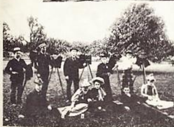
OAC Photographic Club, about 1895 (?)