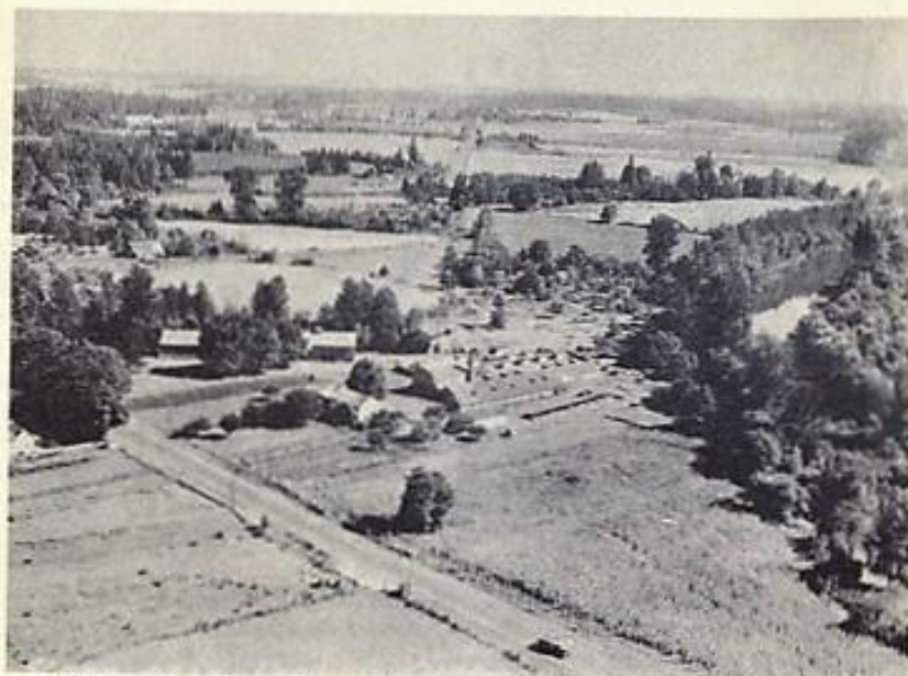
This air view shows the lovely farmlands across the Willamette from Corvallis. This is in Linn county, looking southeast. The road running diagonally in foreground leads to Albany, also to the Lebanon cut-off. Road in center distance leads to Peoria which is located on the Willamette nine miles above here.

Next Meeting: Feb. 5, 1962. (Meetings usually are held in the parlor of the Federated church.)