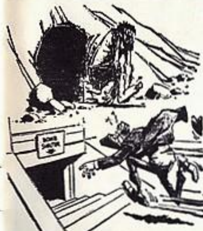
Conrad in the Denver Post The epic of man

IDEAS WANTED to make "Corvallis" a better magazine. Write, Box 122, Corvallis, or drop in at 225 So. 2nd St., Corvallis.