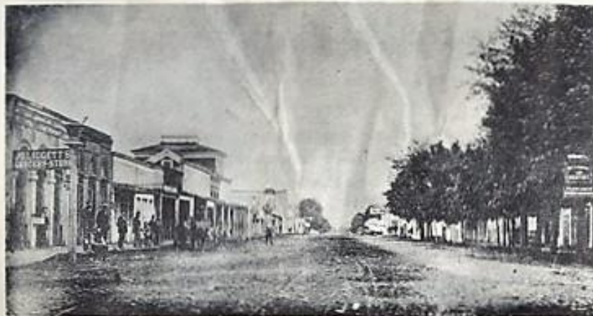
Second Street looking south from Monroe, about 1871-73. The tall, square building in center at left was the old Occidental hotel. The Corvallis hotel is now located on that corner.