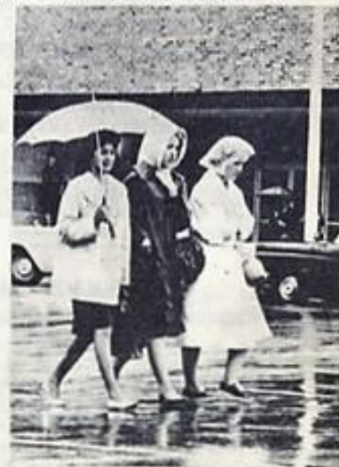
Corvallis girls dressed for rain