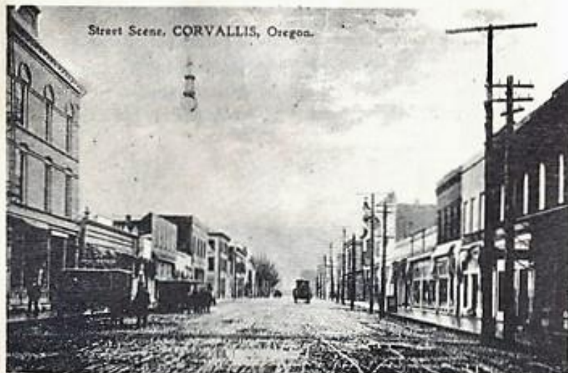
This photograph was made about 1903 looking south from the same place as the picture shown above. Julian hotel is at left. This is the location of the present State hotel. The street was lighted with carbon arcs.