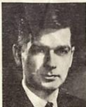
MARK O. HATFIELD Governor

WITH THIS EDITION, as we change our name from "Northwest Challenge" to "Corvallis," we salute our Governor, Mark O. Hatfield.