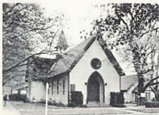
Old Episcopal church building at Seventh and Jefferson streets.