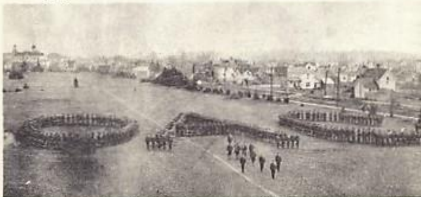
Oregon Agricultural College (now Oregon State University) cadets in unmilitary formation, about 1912? View looks east. Jefferson Street is at right.