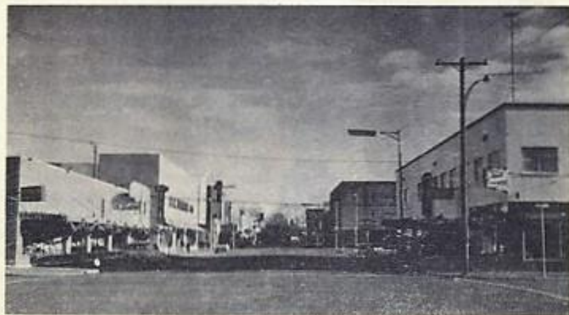
Madison Street, 1961, looking east from Fifth