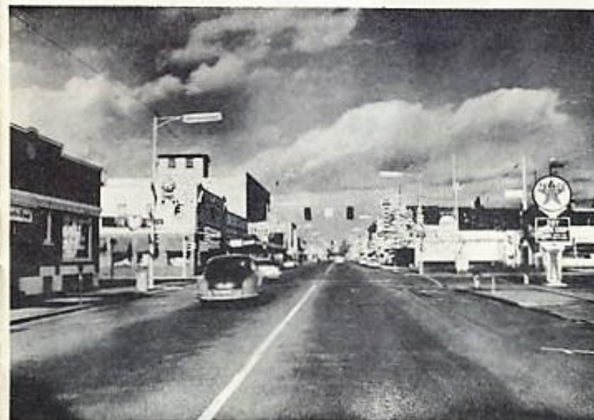
Third Street, 1961, looking north from Adams Street.