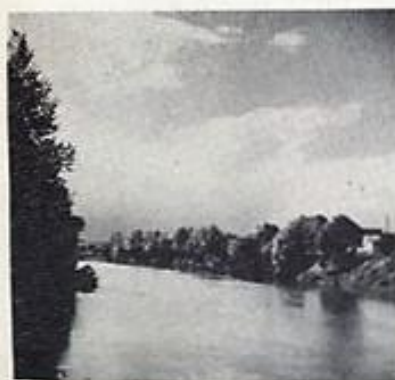
Willamette River at Corvallis, Oregon