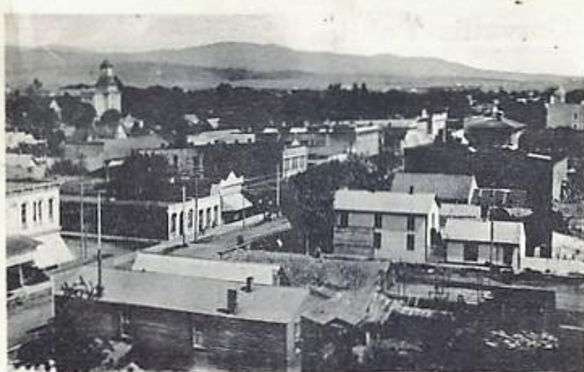
Second Street, about 1907, looking north from the old water tower which was located southeast of the present postoffice building. Steamboat landing was at foot of Jefferson Street, shown in foreground.