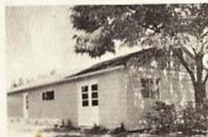
"Corvallis" printing plant