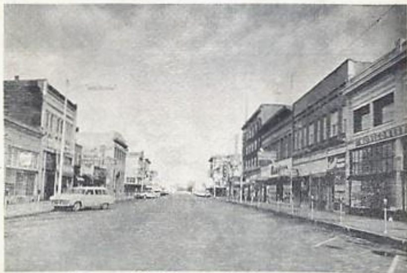
Second Street, Christmas 1961, looking north from Jefferson. Second still has more businesses than any other street in town.